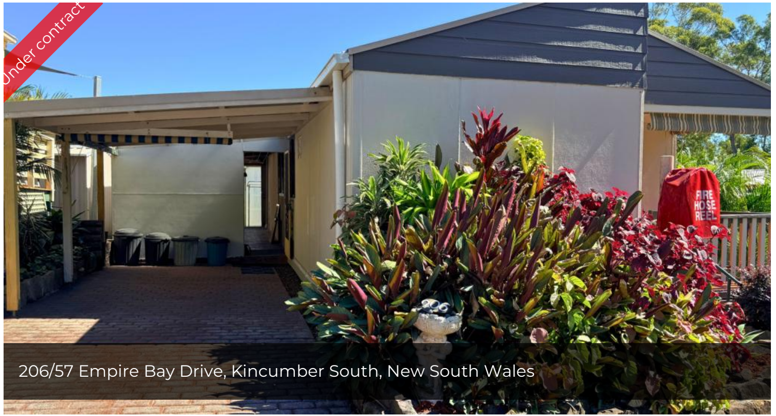
206/57 Empire Bay Drive, Kincumber South, New South Wales