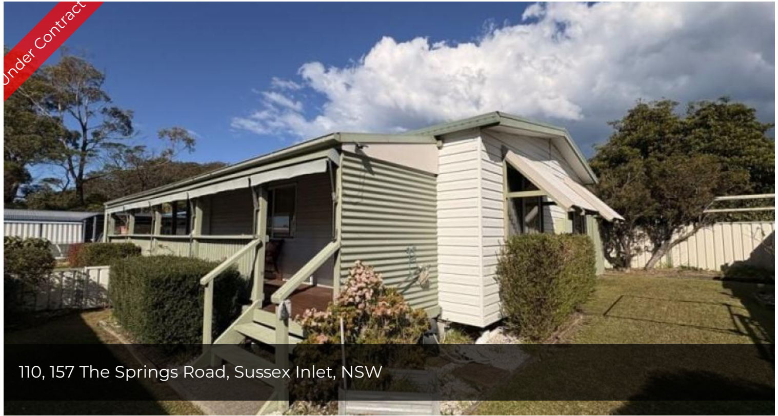
110, 157 The Springs Road, Sussex Inlet, NSW