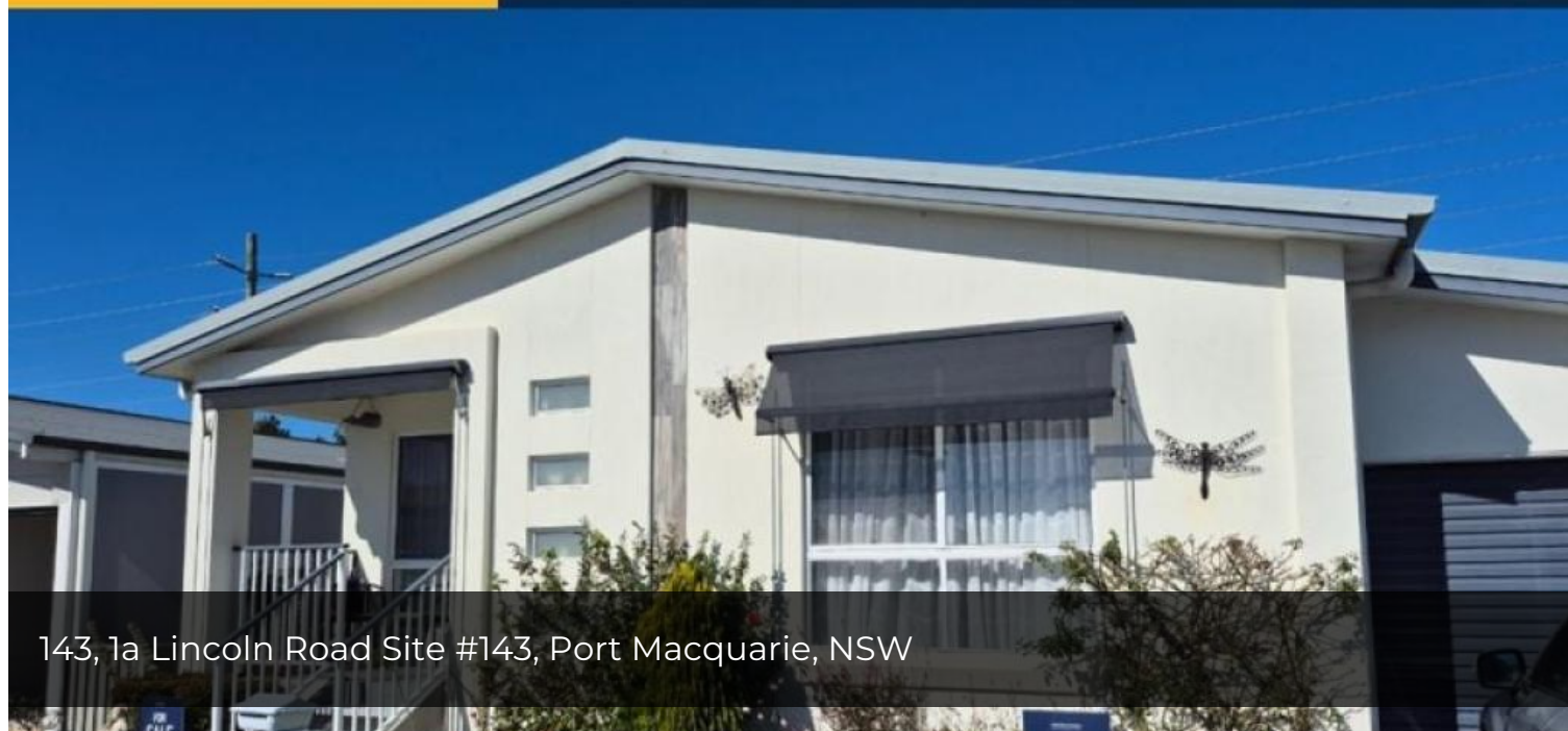
143, 1a Lincoln Road Site #143, Port Macquarie, NSW