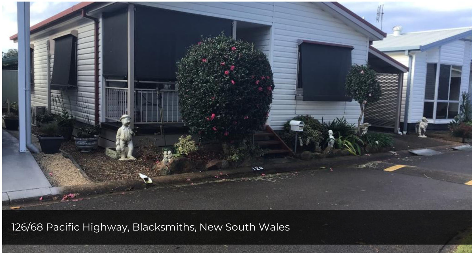
126/68 Pacific Highway, Blacksmiths, New South Wales