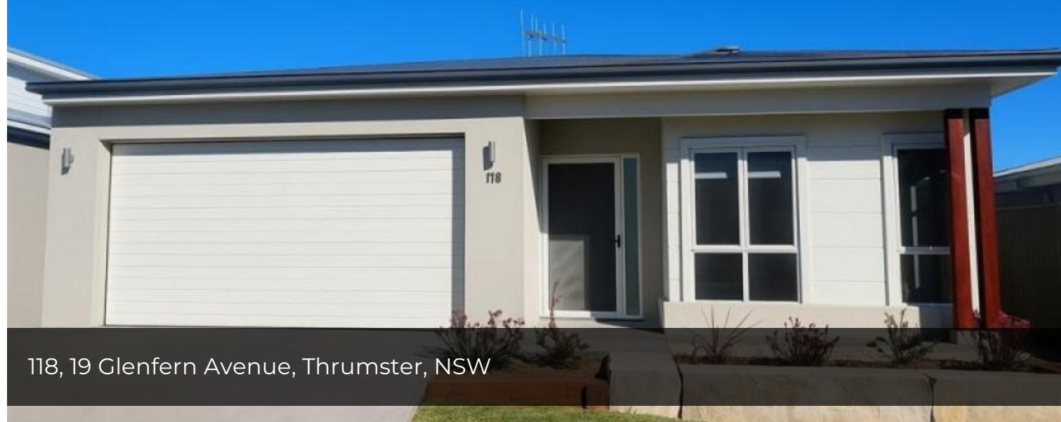
118, 19 Glenfern Avenue, Thrumster, NSW