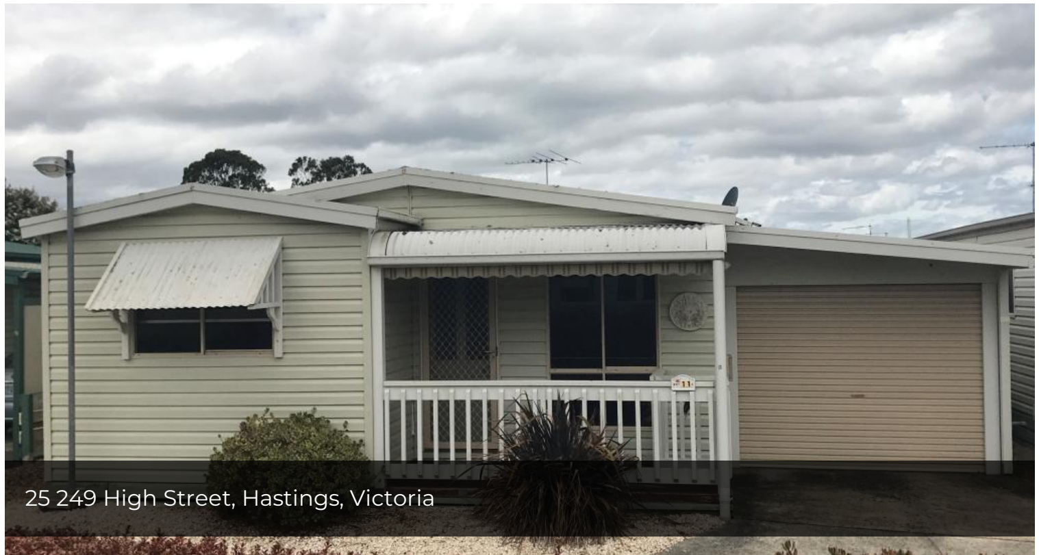
25 249 High Street, Hastings, Victoria