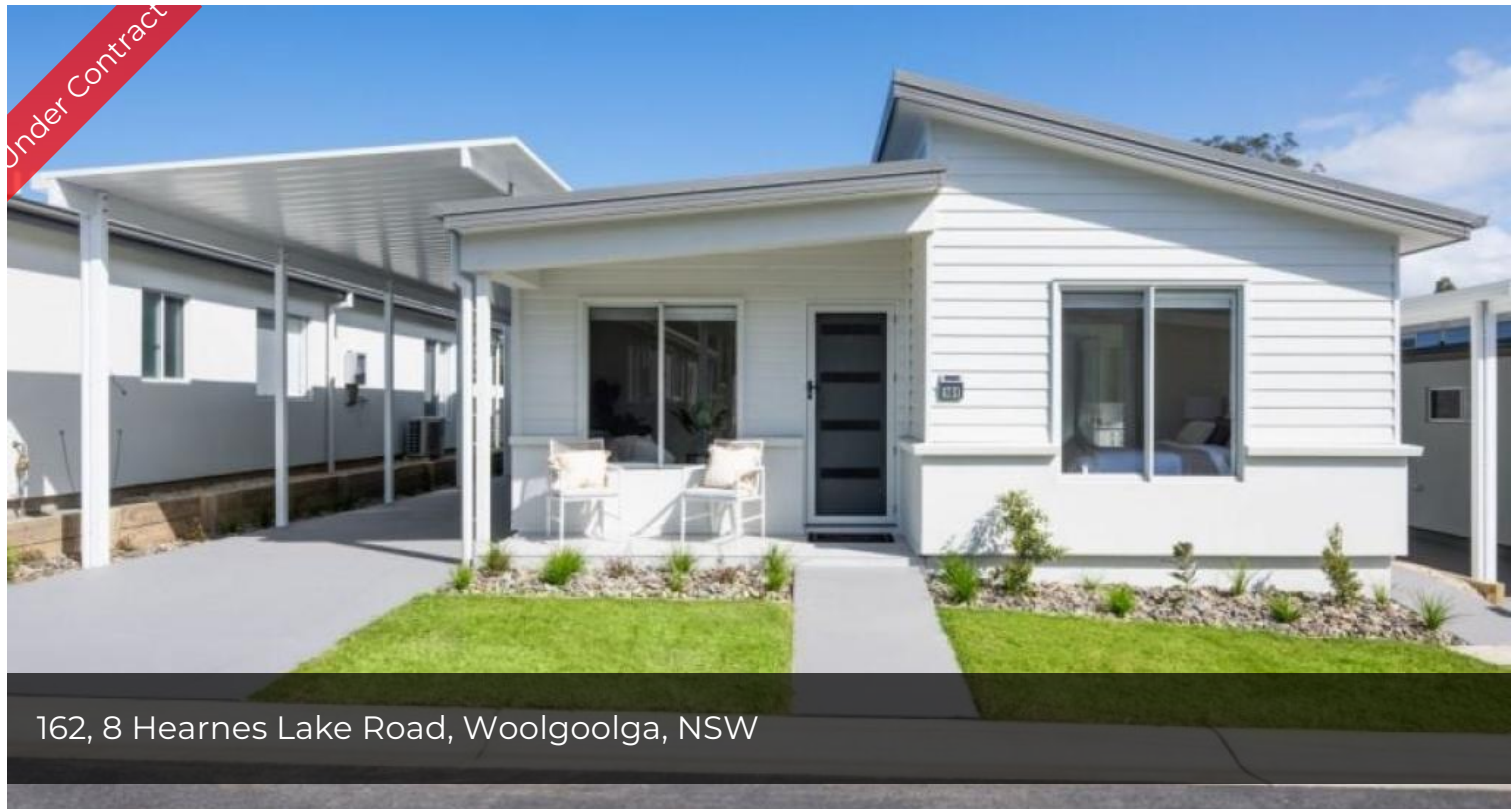
162, 8 Hearn's Lake Road, Woolgoolga, NSW