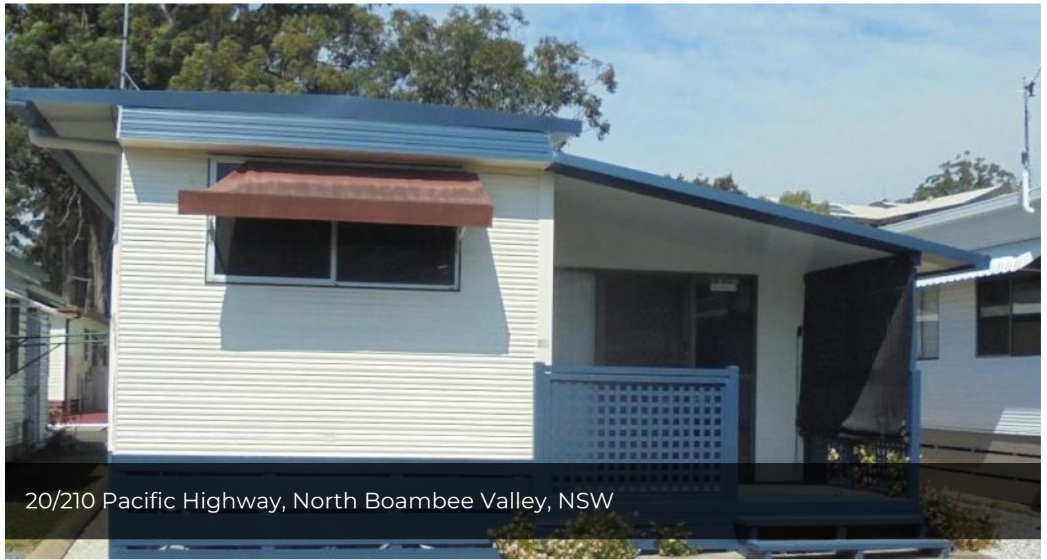
20/210 Pacific Highway, North Boambee Valley, NSW