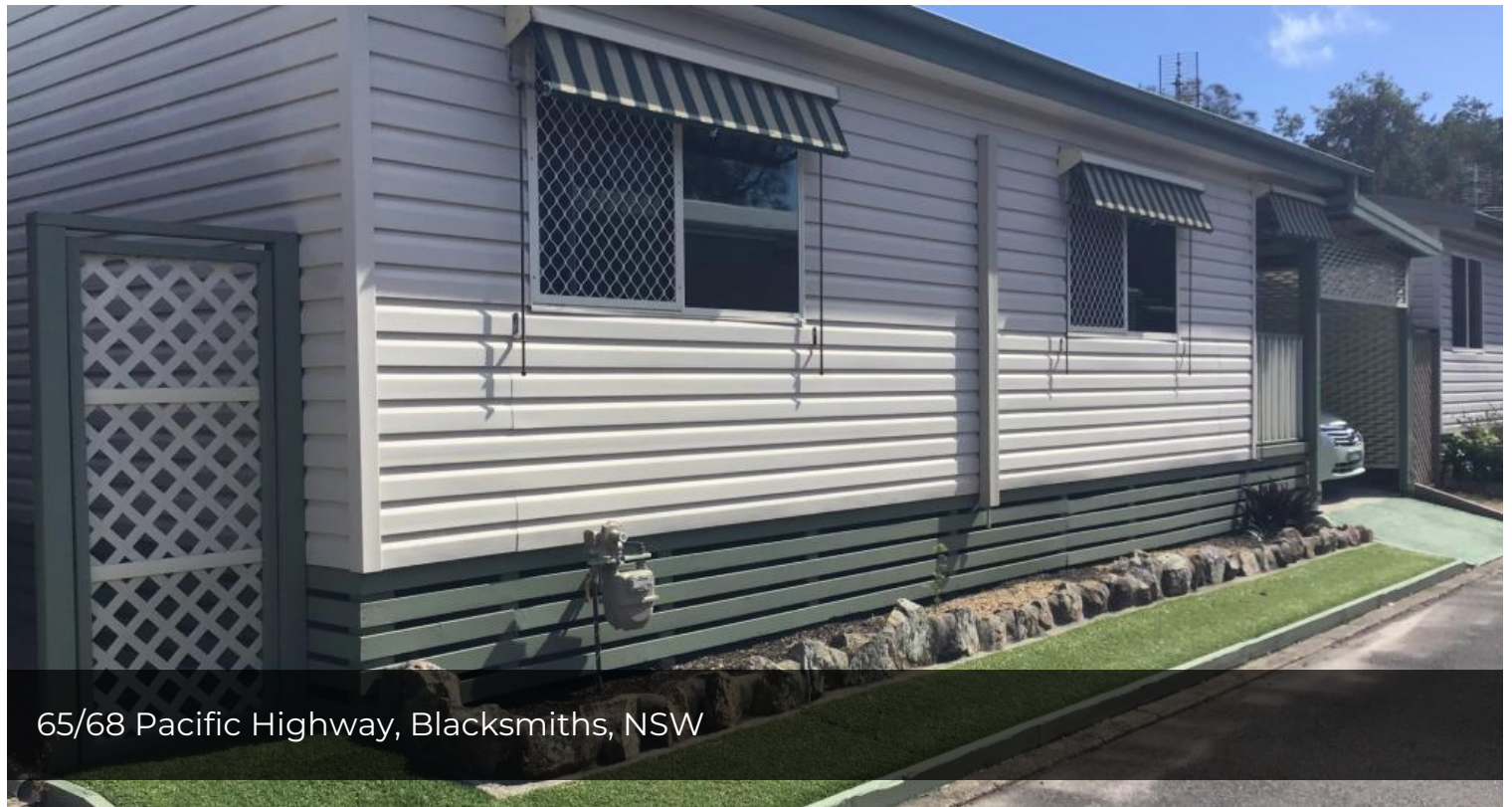
65/68 Pacific Highway, Blacksmiths, NSW