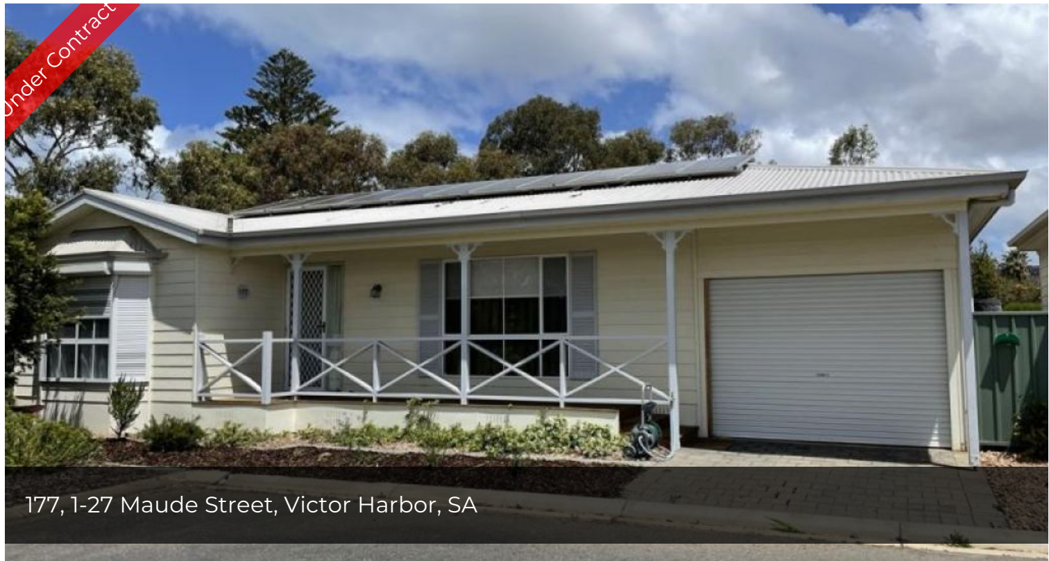
177, 1-27 Maude Street, Victor Harbor, SA