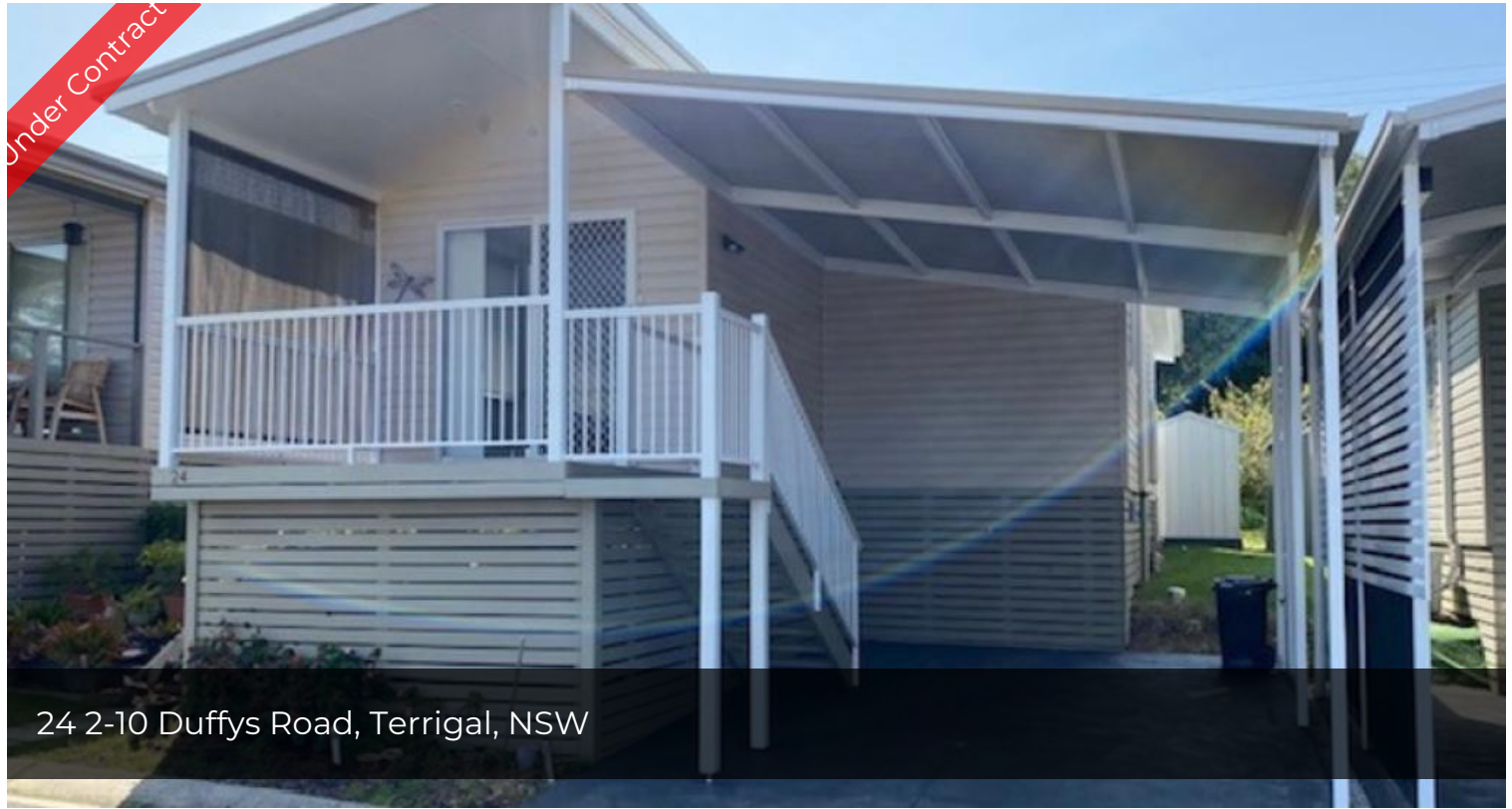
24 2-10 Duffys Road, Terrigal, NSW