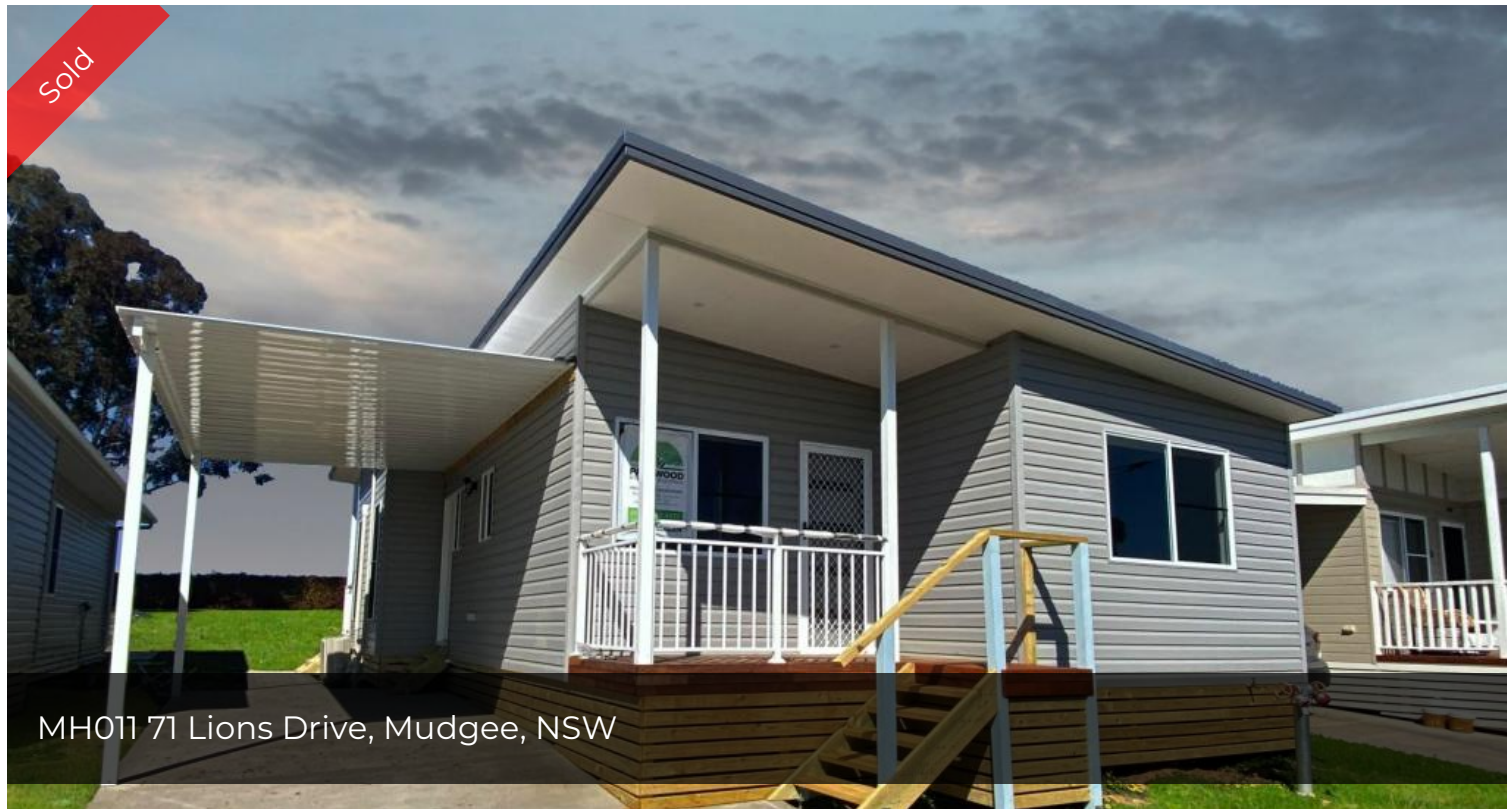
MH011 71 Lions Drive, Mudgee, NSW