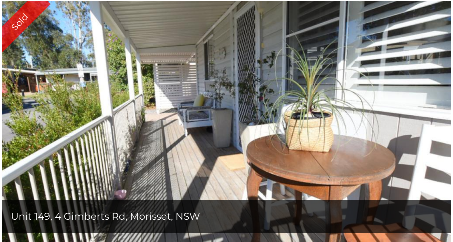
Unit 149, 4 Gimberts Rd, Morisset, NSW