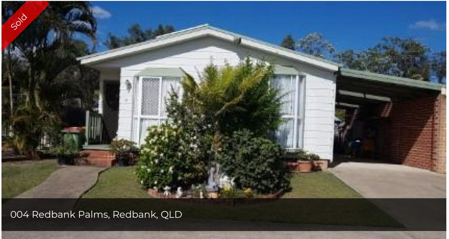
004 Redbank Palms, Redbank, QLD