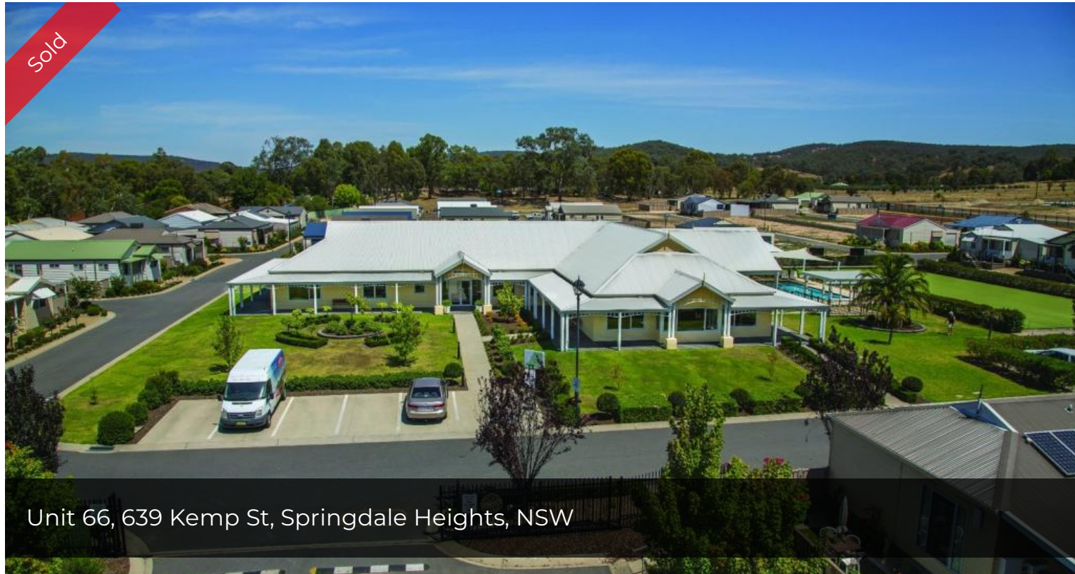
Unit 66, 639 Kemp St, Springdale Heights, NSW