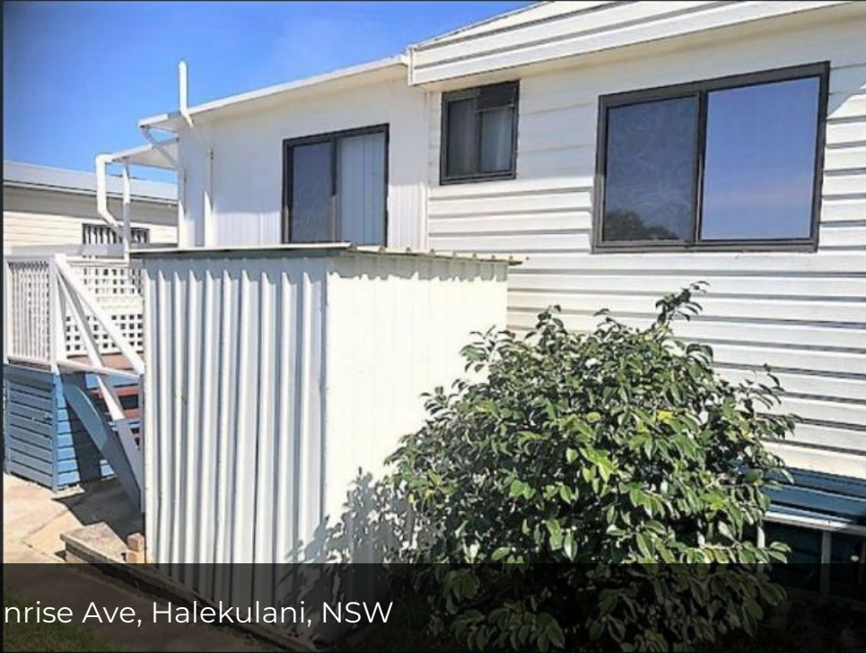
Unit 131, 186 Sunrise Ave, Halekulani, NSW