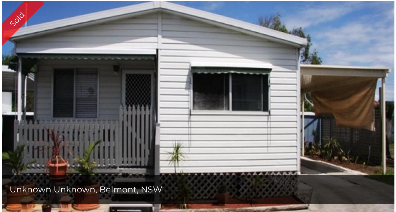
Unknown Unknown, Belmont, NSW