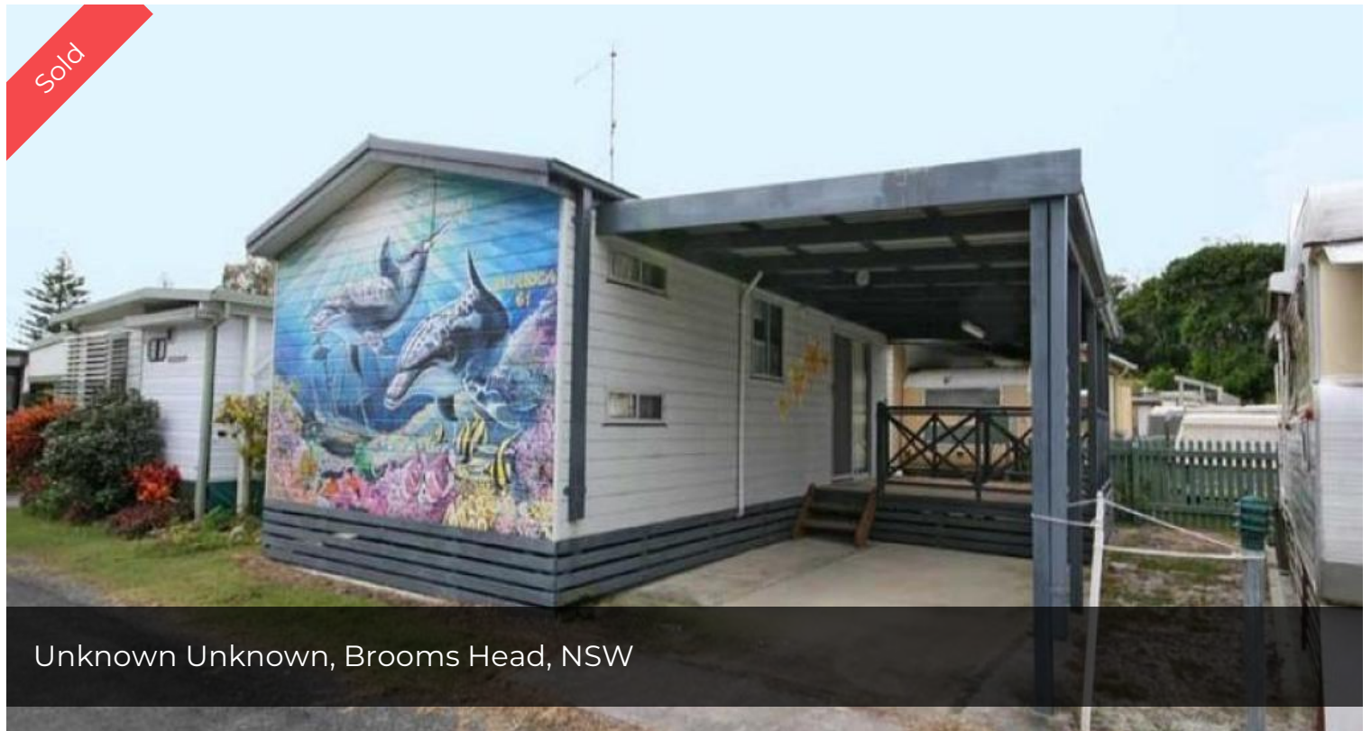
Unknown Unknown, Brooms Head, NSW