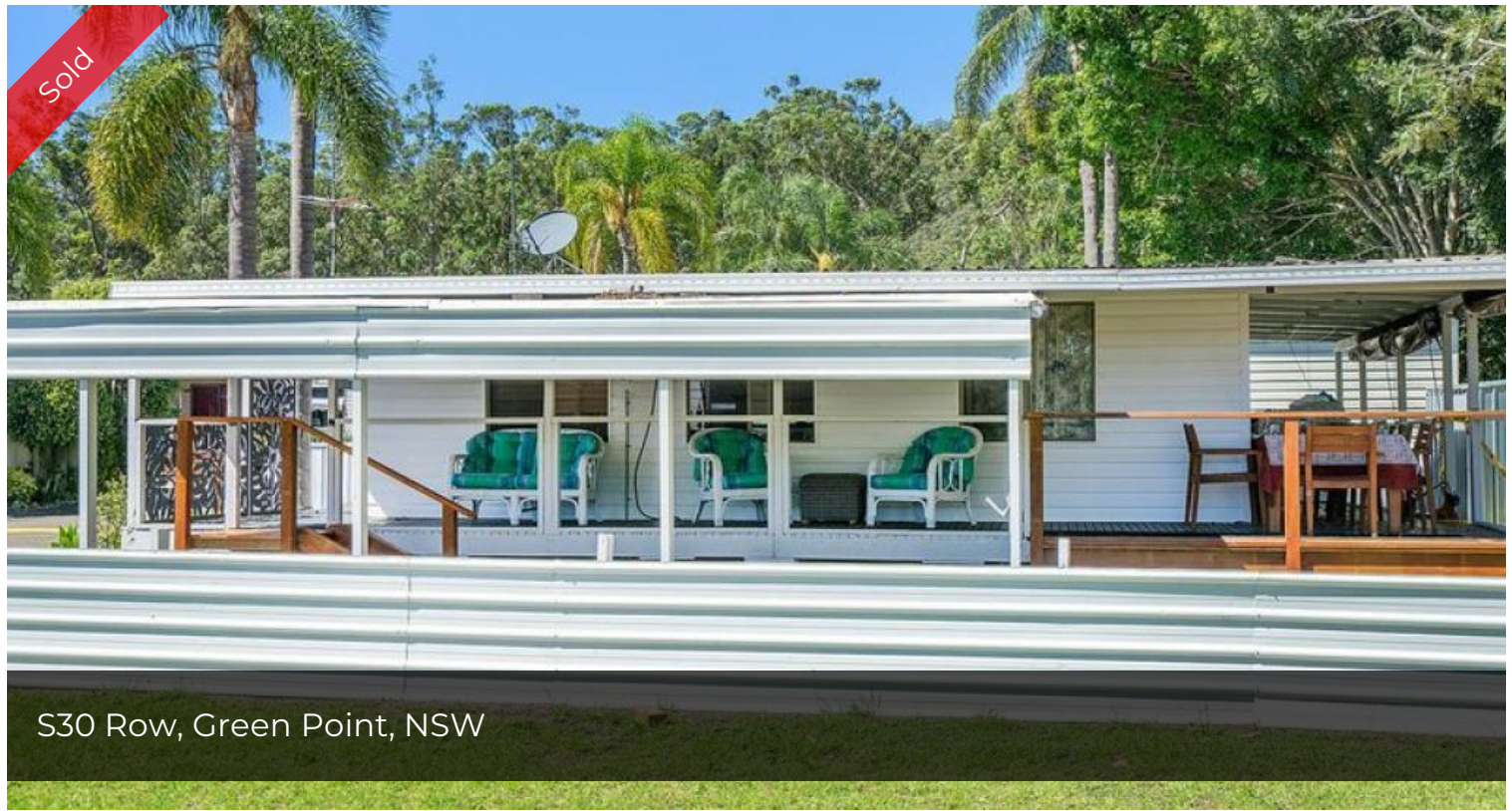
S30 Row, Green Point, NSW