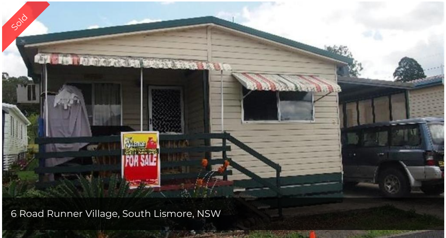
6 Road Runner Village, South Lismore, NSW