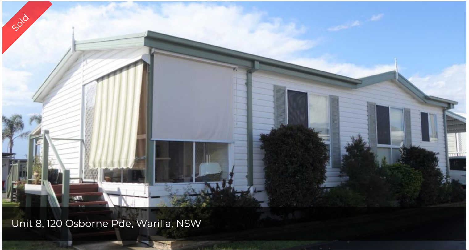
Unit 8, 120 Osborne Pde, Warilla, NSW